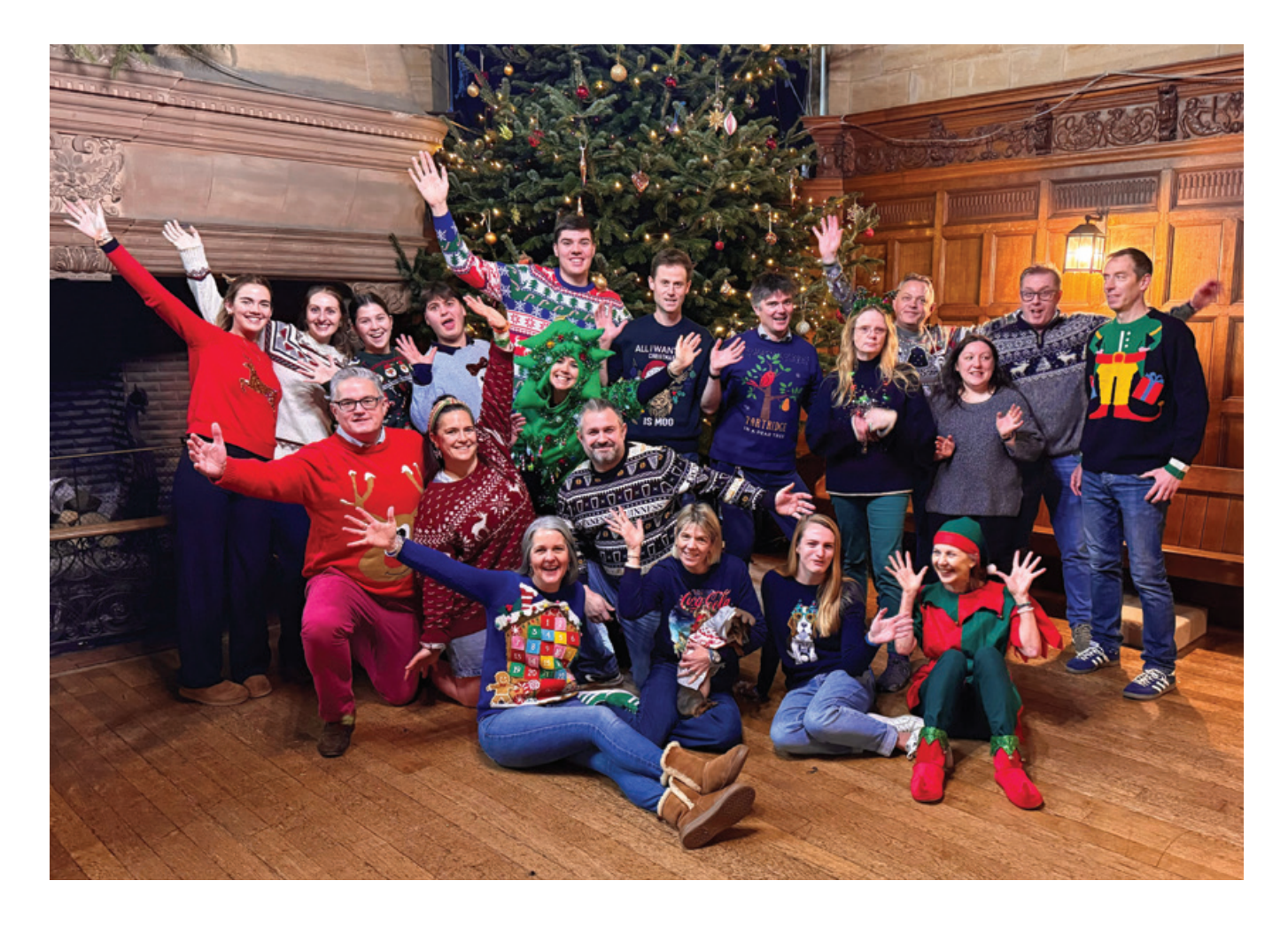
Happy New Year From the Cottesmore Team

Cottesmore School • Buchan Hill • Pease Pottage • West Sussex • RH11 9AU